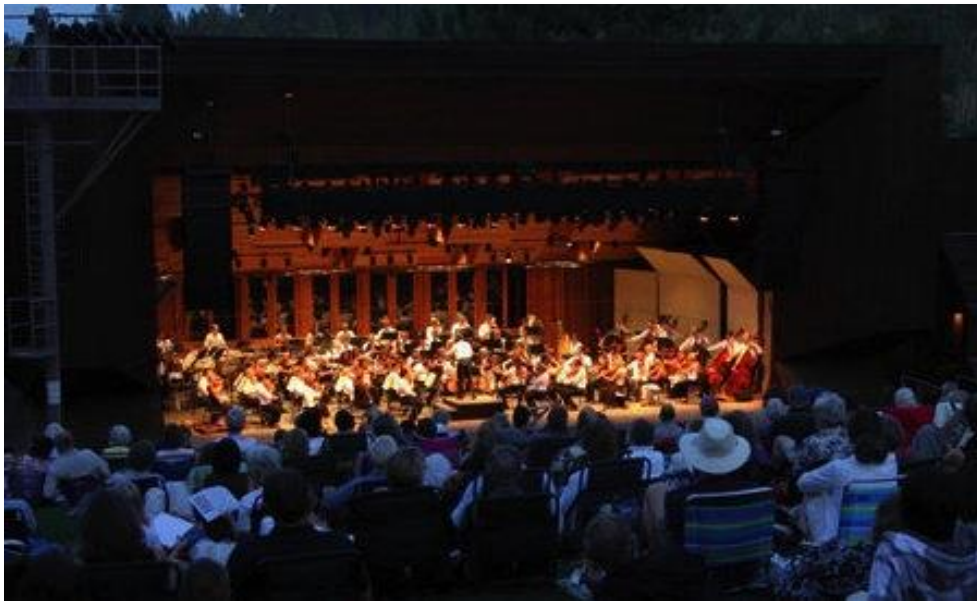
The Britt Orchestra in the Britt Pavilion during the Classical Season

This guide provides information on seating, parking, what to bring, what to expect, and how to enjoy yourself at Britt.