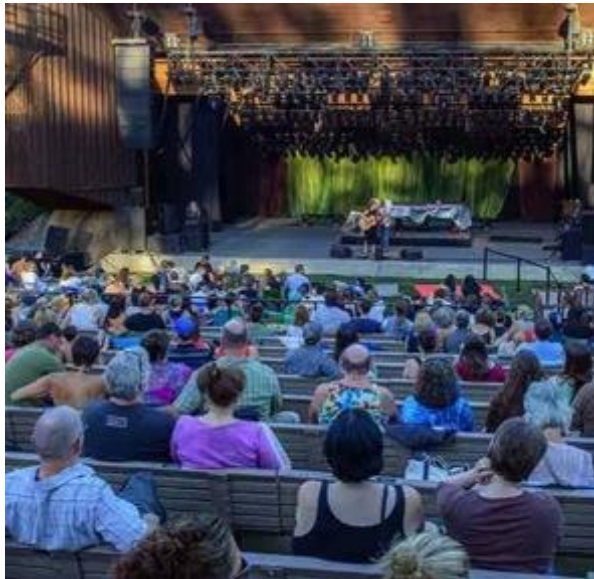
Reserved Seating

You've probably purchased one of two kinds of ticket: reserved seat or a lawn space.