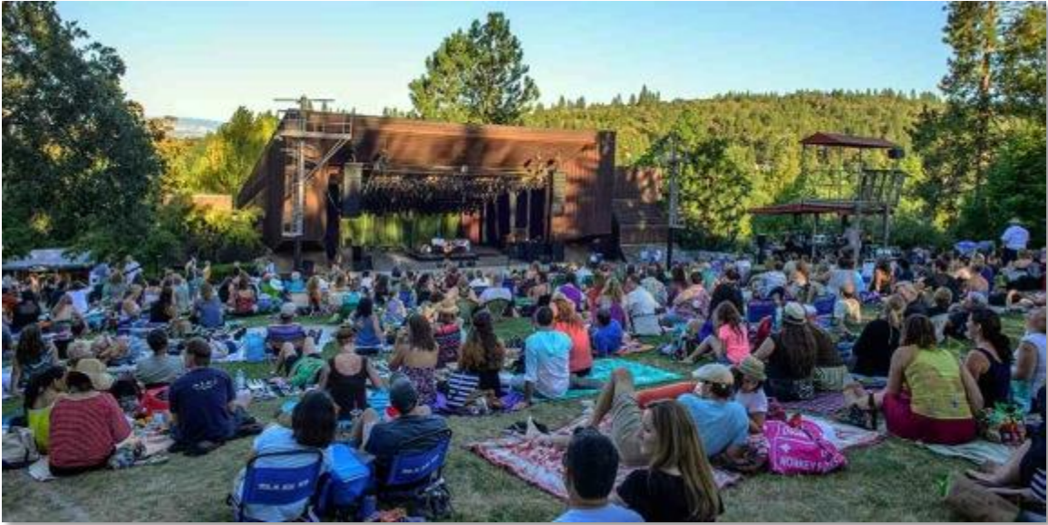
Our patrons enjoying a summer concert at the Britt Pavilion