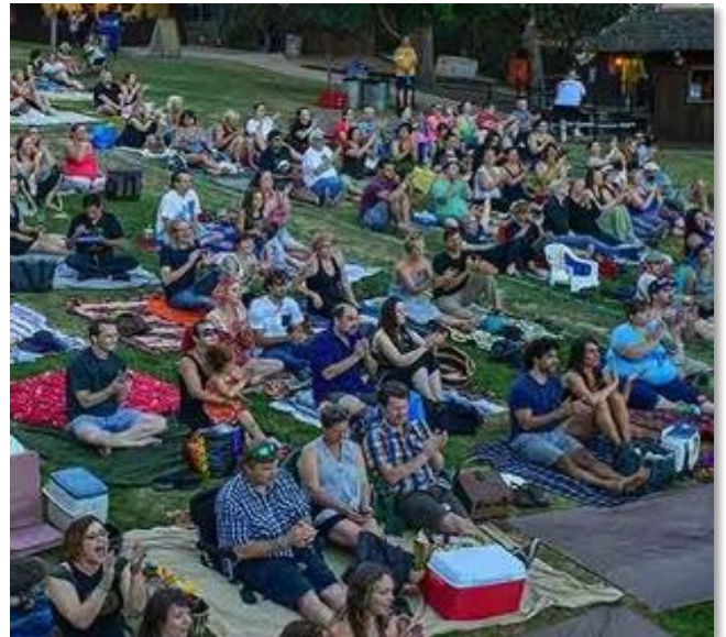
Lawn Space